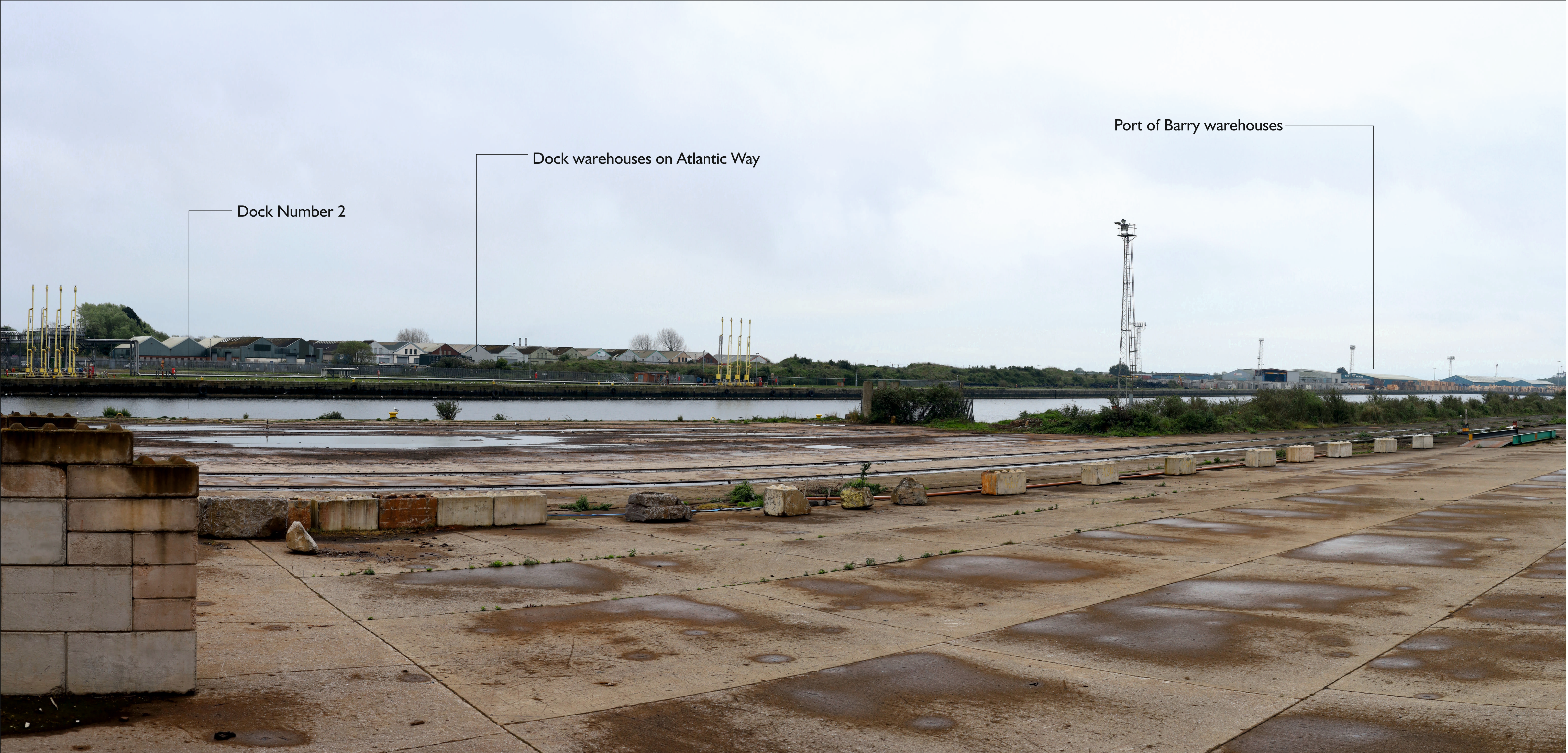
Illustrative Viewpoint 3 - Looking south-southeast from top of block wall located towards centre of the Site